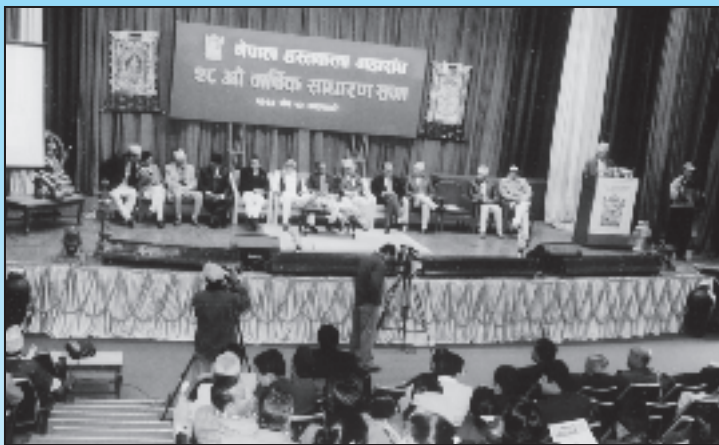
Glimse of Inaugural Session of FHAN 28 AGM