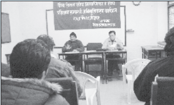
Glimpse of orientation programme on skill testing