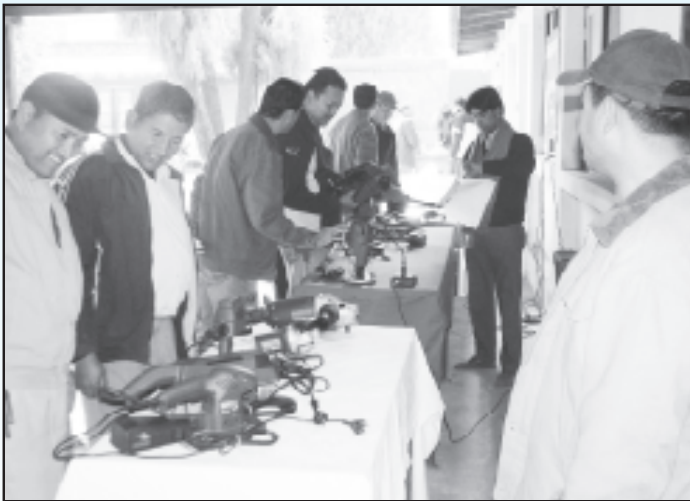
The visitors observing modern tools useful in wood craft sector

With a view to help the enhancement of wooden products, FHAN organized an Exhibition on Modern tools useful for quality production of woodcraft products on December 25, 2007 in Lalitpur. At the inaugural