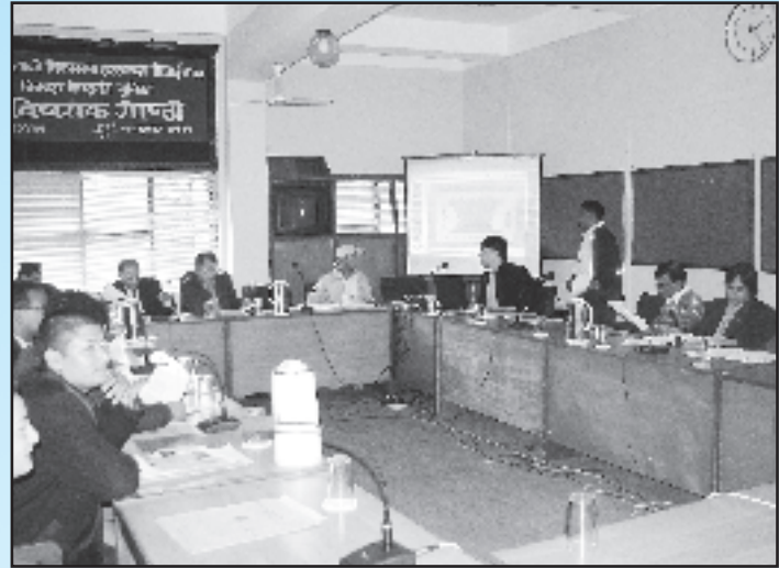
The participants discussing on the subject matter

The workshop discussed on the ways and means to sustain HANDECEN services. Assessing the demand for services, various service packages and the pricing