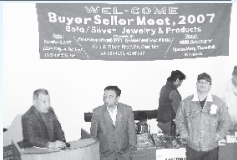
FHAN President Shedding Light on Importance of the programme