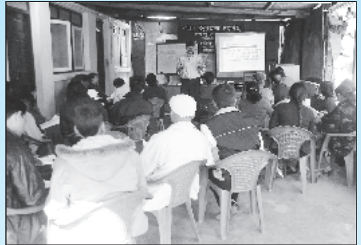
A Resource Person briefing on the subject matter