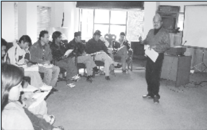
Glimpse of conduction of training on costing and pricing

Similarly, with a view to impart the skill and knowledge on costing and pricing of woodcraft products and help promote the market of such products, FHAN organized training on